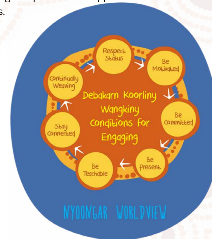
Diagram 2 - Debakarn Koorliny Wangkiny Conditions for Engaging

Diagram 1 demonstrates the steps Richmond Wellbeing will be taking to better support Aboriginal staff and consumers. These steps include assessment, planning, implementation, reflection, and refinement. Each step follows the Debakarn Koorliny Wangkiny Framework for cultural appropriateness and ethical decision-making to ensure inclusivity. This ongoing cycle supports the growth through the Strategic Plan, creating a respectful and supportive environment for Aboriginal individuals.